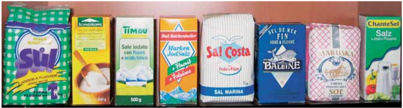
Fig. 2 Examples of European fluoridated salts